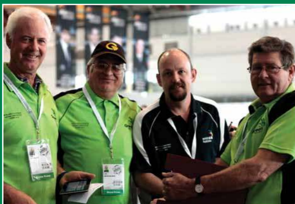
2012 Green Team volunteers in action at the National Competition.

According to assessors, the overall level of performance amongst the competition categories was high, which was reflected in the marking; 25 of the 37 categories audited received a sustainability score of 65% or higher.