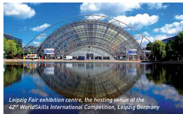
Leipzig Fair exhibition centre, the hosting venue of the 42 nd WorldSkills International Competition, Leipzig Germany

In addition to the competition itself, which will run over four days, the international event will be surrounded by conjunct functions such as an official opening and closing ceremony.