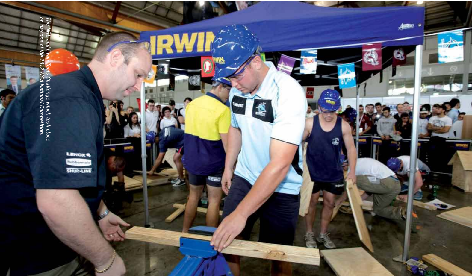
The NRL and Irwin Tools Challenge which took place on day one of the 2012 WSA National Competition.