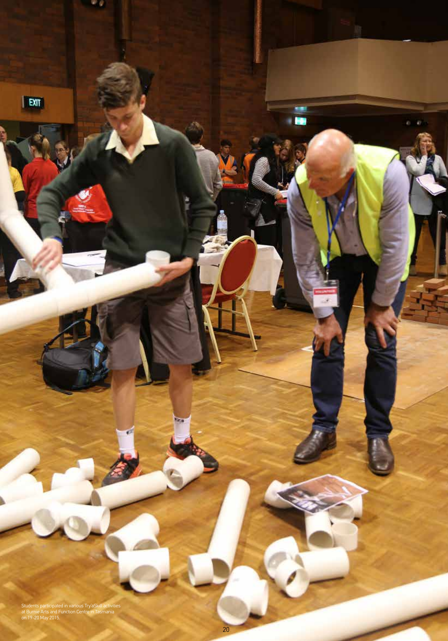
Students participated in various Try'aSkill activities at Burnie Arts and Function Centre in Tasmania on 19-20 May 2015.